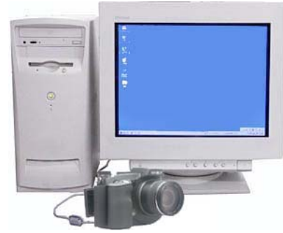
When copying via DiMAGE 7Hi connected to PC using USB-cable USB-100