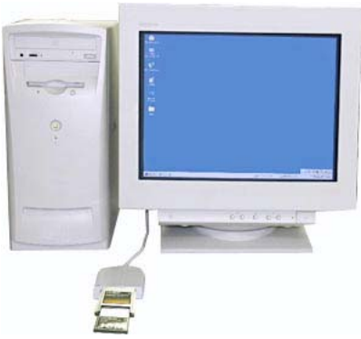
When copying via CompactFlash card drive

Use one of the following methods to prepare a CompactFlash card to update the firmware. Format a 4 MB or larger CompactFlash card in the camera