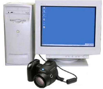
When copying via DiMAGE Z3 connected to PC using USB-cable USB-2