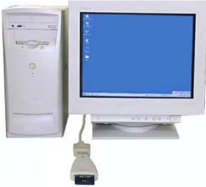
When copying via CompactFlash card reader